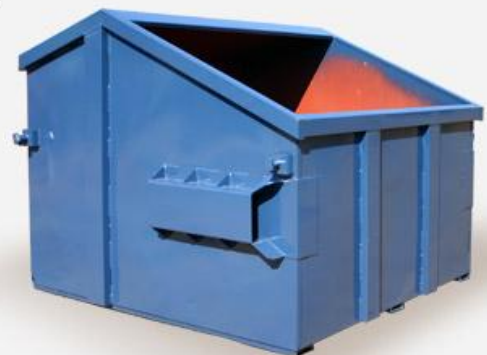
6m 3 FEL Skip

On request, we can build smaller bins in the sizes of a 4m 3 and 2m 3 containers.