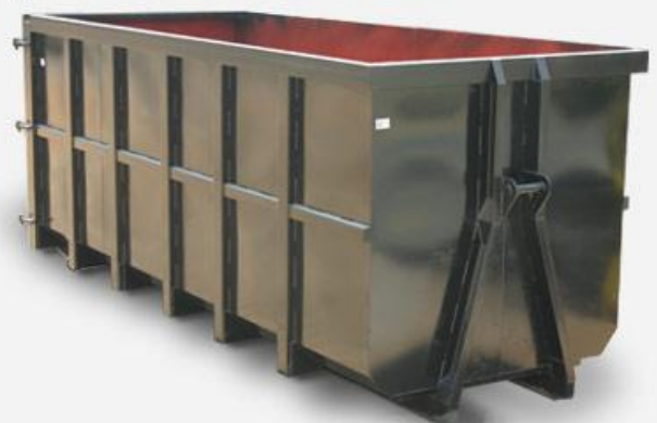
28m 3 Skip

The door is fitted with a locking mechanism. These bins can be manufactured to clients' specifications in both size and material to be used.